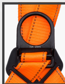
Dorsal D Ring