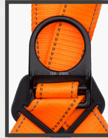
Dorsal D Ring